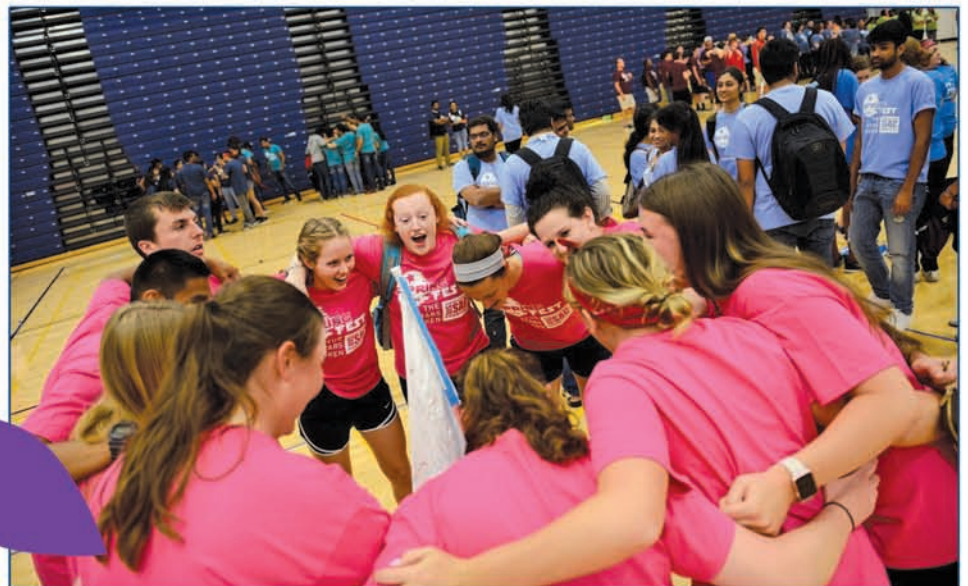
Showing team spirit (2017)