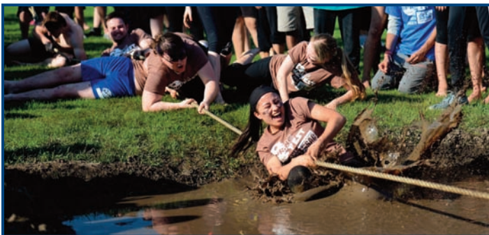
Annual Mud Tug-Of-War