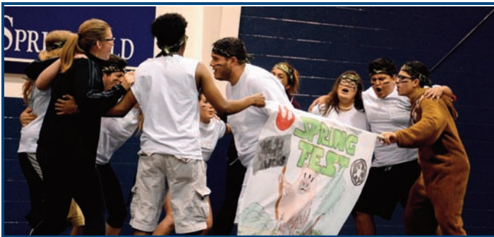
Song & Chant by The Mighty Ewoks (2017)