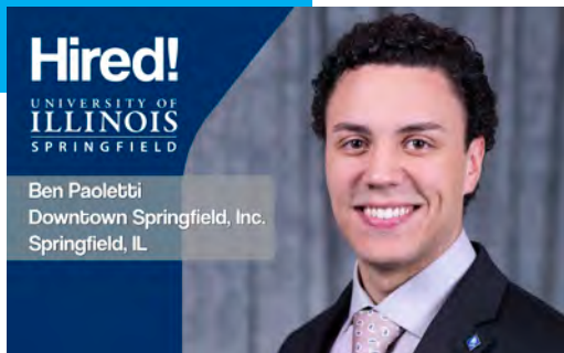
Political Science and Philosophy major to Program coordinator

Aurora University Maryville University Purdue University – West Lafayette University of Illinois Chicago Eastern Illinois University Northern Illinois University Southern Illinois University Edwardsville University of Illinois Springfield Liberty University Pennsylvania State University University of Illinois Urbana Champaign