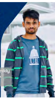
Computer Science major to SAP ABAP Developer