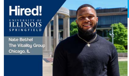
Computer Science major to Information Assurance Security Analyst