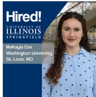
Biochemistry major to Researcher II