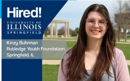
Criminology & Criminal Justice major to Case Worker Specialist

Keuka College (New York) Purdue University Global University of North Alabama