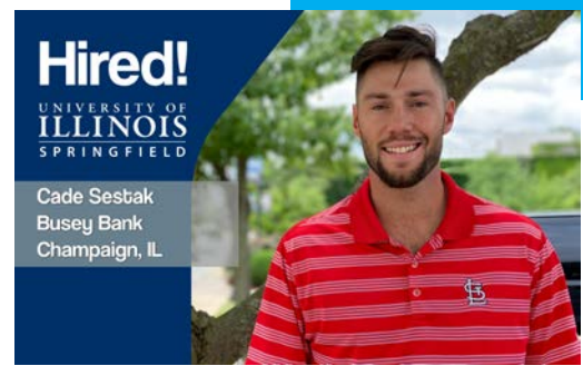
Business Administration (MBA) major to Commercial and Wealth Analyst