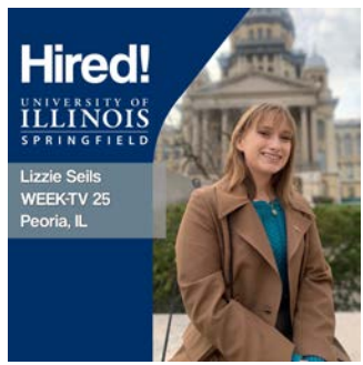
Public Affairs Reporting major to Multimedia Journalist