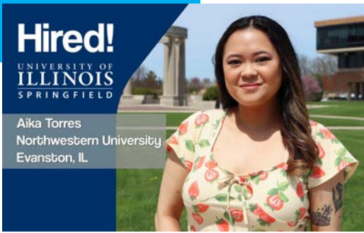
Educational Leadership major to Admissions Manager